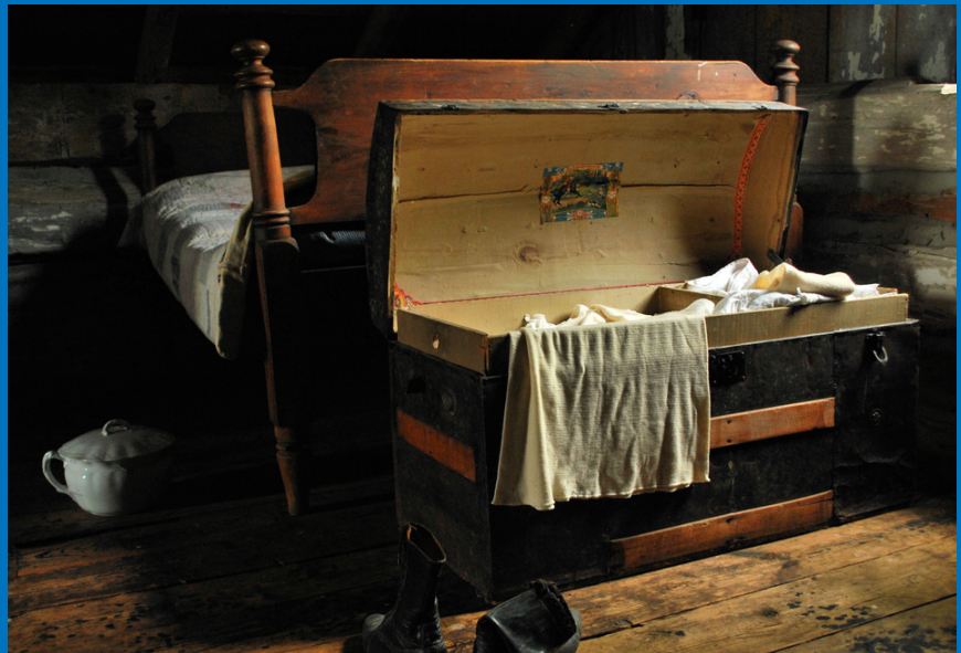
Includes photographs courtesy of David Brooks Photography