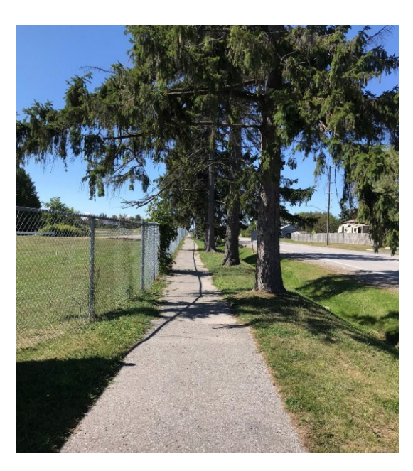
FIGURE D.3: MULTI-USE PATH ON REACH STREET WEST OF BIGELOW STREET

The trees on Reach Street should be trimmed to provide an overhead clearance of 2.1 metres per the Integrated Accessibility Standards of the Accessibility for Ontarians with Disabilities Act.