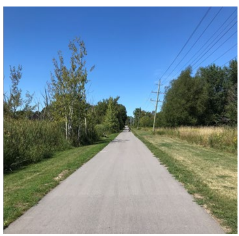
FIGURE D.9: WATERFRONT TRAIL