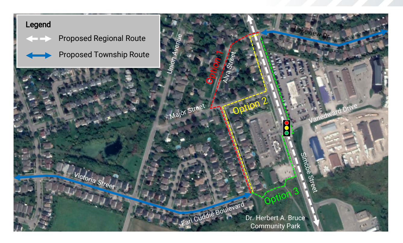
FIGURE D.2: OPTIONS TO CONNECT HERBERT A. BRUCE PARK TO SIMCOE STREET

The unsignalized intersections at both ends of the route could present challenges to cyclists. Both intersect high-volume roads (Simcoe Street and Scugog Street) and are located too close to existing signalized intersections to allow for additional traffic control signals. To connect to nearby routes, cyclists should be directed to the closest signalized intersections, Simcoe Street and Vanedward Drive and Scugog Street and Water Street, using wayfinding signs. Section 3 presents options for linking the Lakeview Drive end to the Victoria Street and Earl Cuddie Boulevard route and the Carnegie Street terminal to the Waterfront Trail.