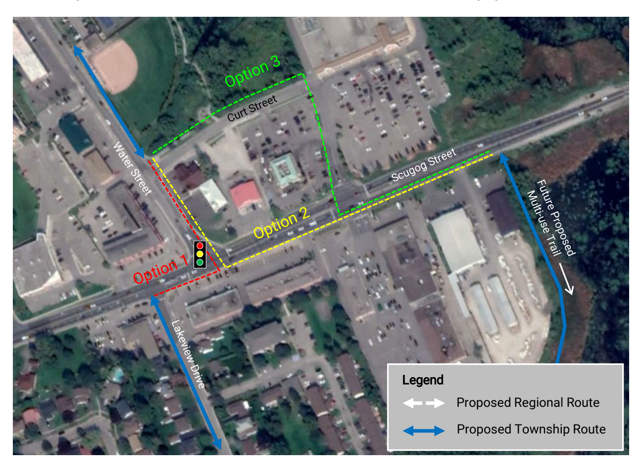
FIGURE D.8: OPTIONS TO CONNECT CURT STREET TO SCUGOG STREET FOR WATERFRONT TRAIL