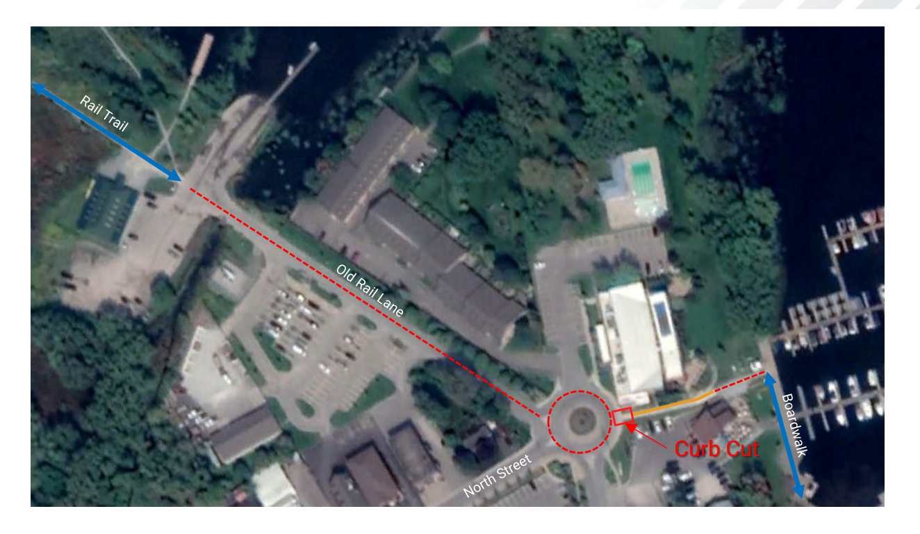
FIGURE D.7: OPTION TO CONNECT BOARDWALK TO RAIL TRAIL FOR WATERFRONT TRAIL