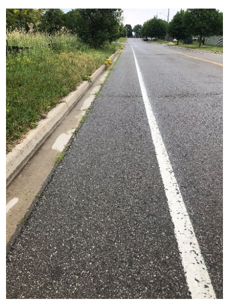
FIGURE D.4: UNION AVENUE URBAN SHOULDER

The Township should begin by posting on-road bike route signs along Union Avenue. Urban shoulders are currently provided on both sides of Union Avenue from Josephine Street to Major Street, as Figure D.4 shows. Near term construction plans include providing bike lanes to King Street. The Township should construct and mark these features as bike lanes where feasible. The remaining section of Union Avenue from Major Street to Lorne Street is also contemplated for reconstruction, although not in the immediate term. Bike lanes should be included in the project.