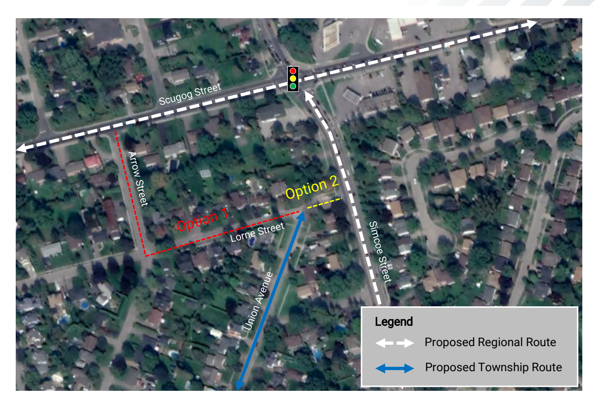
FIGURE D.5: OPTIONS TO CONNECT UNION AVENUE