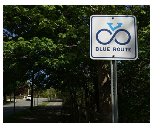
FIGURE D.6: SAMPLE WAYFINDING SIGNS